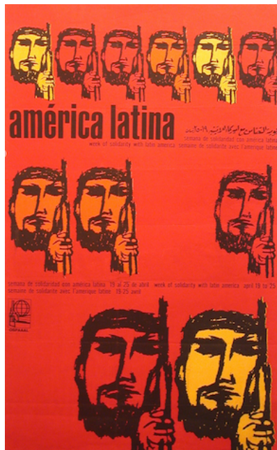
Artist unknown, Folder 6, SS674-100, “Semana de solidaridad con America Latina 19 al 25 abril”, Sam Slick Collection, University of New Mexico Library.