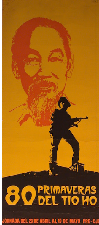
Jose Papiol Torrent, “80 Primaveras del Tio Ho”, folder 30, SS674-563”, “Jornada del 23 de abril al 19 de mayo pre-CJC”, COR-Nacional, Cartel Screen, Mayo – 1970.