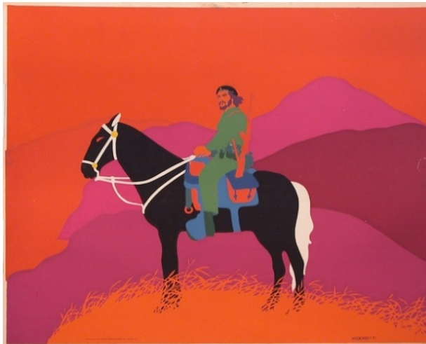
Rene Mederos, "Rocinante," folder number 25 "Mederos", pictorial number SS674-469, 1971, stamped on back "Taller de Divulgacion", printed by Comisión de orientación revolucionaria del CC-PCC 1972, Sam Slick Collection, University of New Mexico Library.

reproduceable, cinematic poster art, visually suggested that the struggle for liberation had found its way into the idiom of the times. 38 OSPAAAL's poster art iconographically connected the ideological struggles of Latin American revolution with those of Vietnam, Palestine, the Congo, Yemen, and elsewhere, suggested the ability of individual causes to be considered from within a comparative frame and as interconnected on a trans-regional level. These posters also visually framed Castro's desire for solidarity action to move away from Nasserism, which limited as a "gatekeeper" Latin American internationalist approaches to solidarity action in international institutions. Appealing to the Afro-Asian bloc, the poster art used mirroring language, using symbolic and visual connections not only to identify, but also to demonstrate a more thorough rendering of these struggles.