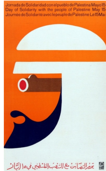
Faustino Perez, "Day of Solidarity with the Palestinian People," 1968, Published by OSPAAAL, Palestine Poster Project Archives .